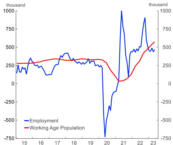
Employment and Working Age Population Annual Change in Numbers