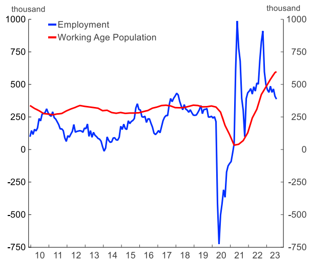
Employment & Working Age Population Annual Change