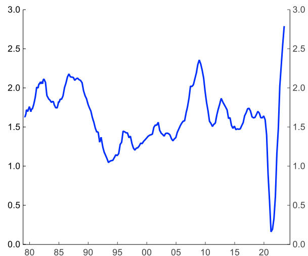
Working Age Population Annual % Change